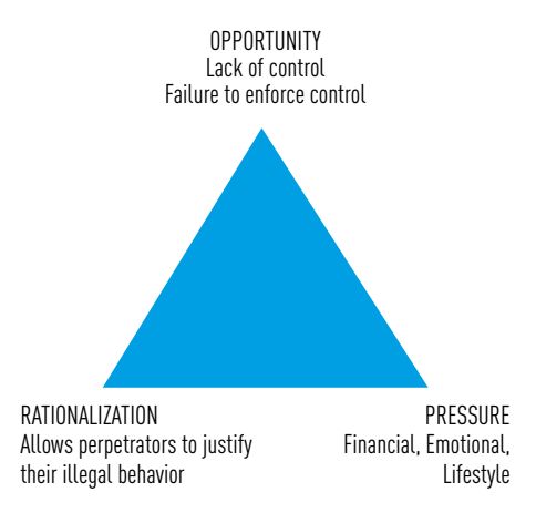
Figure 1: The Fraud Triangle

disrupt societal unity and are a basis for conflict and instability. A tolerance to low level corruption can result in desensitisation and has the potential to lead to higher levels, where the opportunity arises. Corruption and fraud<sup>4</sup> are often linked. The fraud triangle is a framework designed to explain the reasoning behind the decision to commit fraud, with opportunity a key aspect.